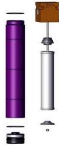
Figure #3: Activated Carbon