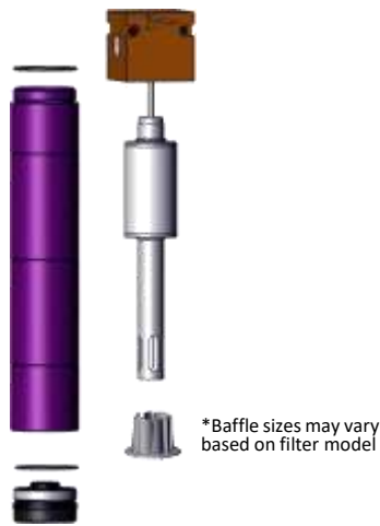
Figure #1: Water Separator