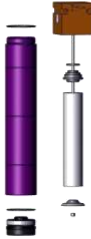
Figure #2: Oil Coalescing Filter